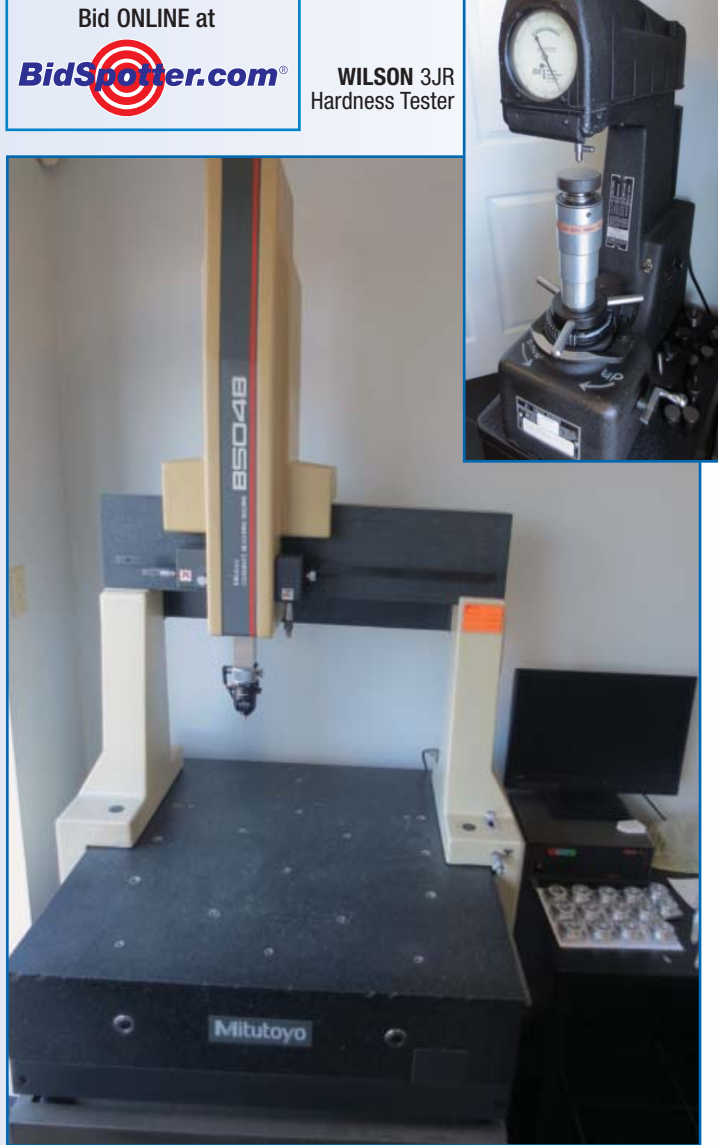
MITUTOYO B504B CMM With Travels X-20", Y-16", Z-12", Computer And Interface, Code 195-121, s/n 9110010