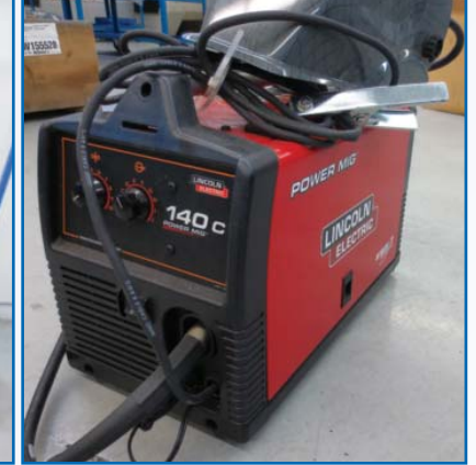
LINCOLN 140C Power Mig Welder