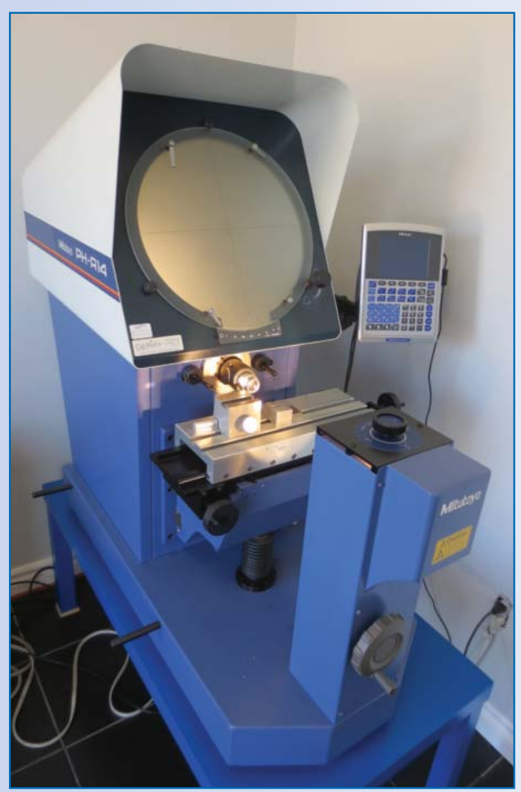
MITUTOYO PH-A14 Optical Comparator With QM-Data 200 Readout, 14" Screen, 8" X 4" Travel, 100 Lbs. Cap., Linear Glass Scales, Code 172-810A, s/n 605014