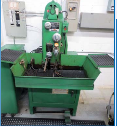
SUNNEN MBB-1660K Precision Honing Machine With Tooling, S/N 82598