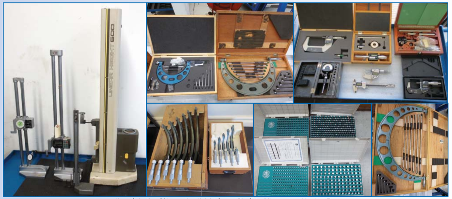
Huge Selection Of Inspection Height Gages, Pin Sets, Micrometers, Verniers Etc.