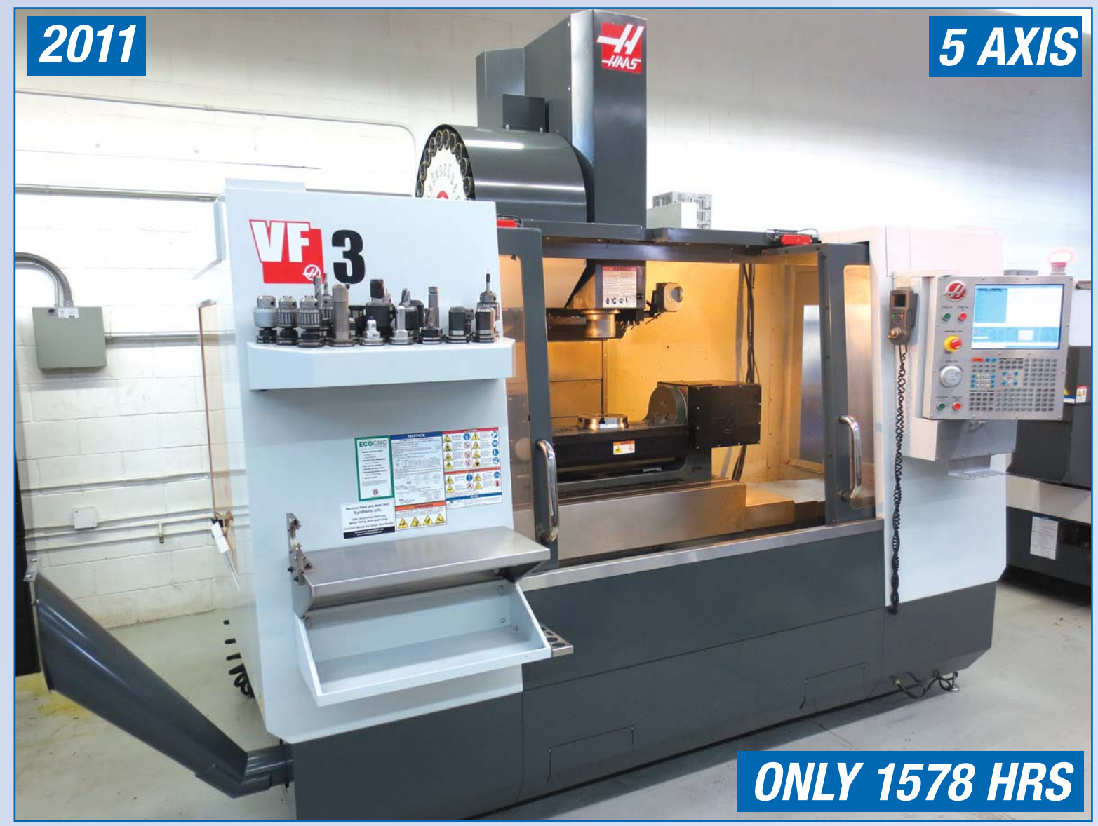
HAAS VF-3 CNC VERTICAL MACHINING CENTER