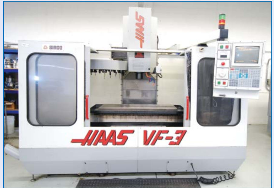
HAAS VF-3 CNC Vertical Machining Center, With HAAS CNC Control, 18" X 48" Table, Travels: X-40", Y-20", Z-25", Cat 40, 4th Axis Ready, 7,500 RPM, 24 ATC, 15 HP High Torque, Programmable Coolant, 208/230 Volt 3 Phase, S/N 5325