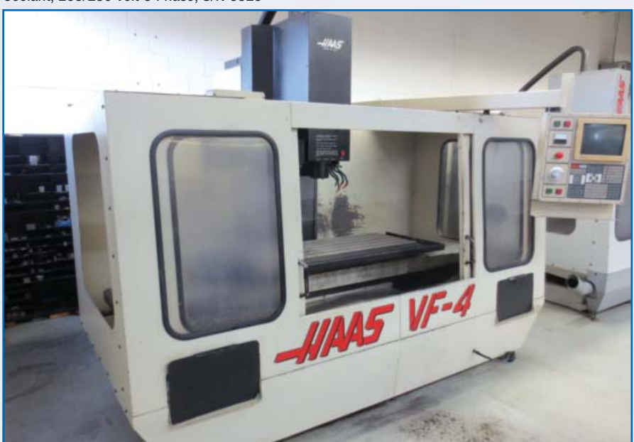
HAAS VF-4 CNC Vertical Machining Center With HAAS CNC Control, 18" X 52" Table, Travels: X-50" X, Y-20", Z-25", Cat 40, 4th Axis Ready, 20 ATC, 208/230 Volt, 3 Phase, S/N 2418