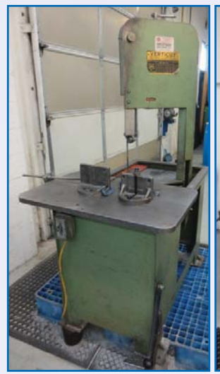
VERTICUT 115B Roll In Bandsaw With 10" X 13" Cap., 13" Throat, Mill With Dro, Power Feed S/N 372