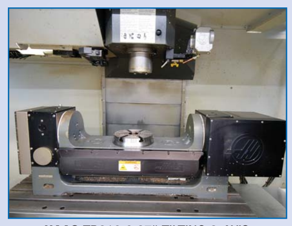
HAAS TR210 8.27" TILTING 2-AXIS TRUNNION ROTARY TABLE

2011 HAAS Vf-3, 5 Axis CNC Vertical Machining Center With HAAS TR210 8.27" Tilting 2-Axis Trunnion Rotary Table With Scale Feedback (sn 904100), HAAS CNC Control, 48" X 18" Table, Travels: X-40", Y-20", Z-25", 5th Axis A&B (Tilting & Rotary) 0.001 To 60 Deg./Sec., 200 Lb. Cap., 23.5" Max Part Swing, 300 Ft-Lb Torque, 10,000 RPM, Cat 40, 24 Side Mount ATC, Programmable Coolant, Pendant Control, 2 Speed Gearbox, Chip Auger, s/n 1086185