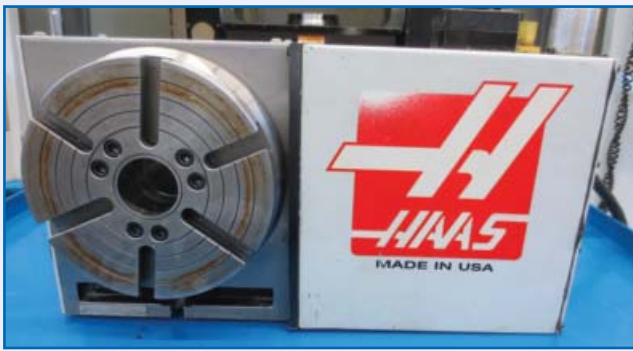
HAAS HRT-210, 4th axis rotary table with CNC Interfacing to M Functions, Variable Feedrates, RS232 Interface, Absolute or Incremental Programming, Auto Circle Division & Cabling